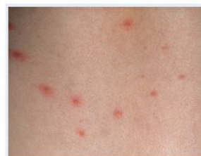
1. Chickenpox starts with red spots. They can appear anywhere on the body.

We have seen a larger than average confirmed cases of Chickenpox this term.