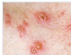
3. The spots scab over. More blisters might appear while others scab over.

Other symptoms may include: a high temperature above 38C, aches and pains, loss of appetite and generally feeling unwell.