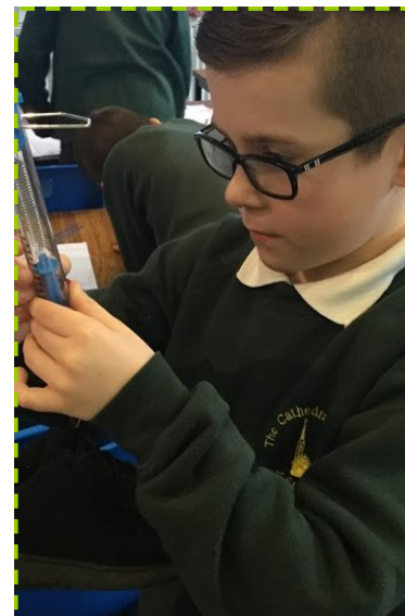
Exploring forces in one of our science lessons last term

The children will soon be receiving their Summer Homework pack. (Year 6 will be slightly different) Please ensure that as much of this is completed as possible and that the children are given the time and resources needed to complete it to a high standard. If the children find any aspect of the homework overly challenging and you do not feel comfortable supporting them with this then there is a homework club on Tuesdays from 12:15–12:30 where I will point them in the right direction. Please ensure that all homework is completed and in school by the Friday of each week. Thank you for your support with this.