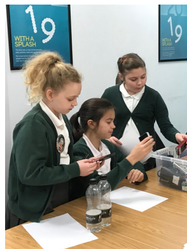
Exploring phones of the past!

The children will soon be receiving their Spring Homework pack. Please ensure that as much of this is completed as possible and that the children are given the time and resources needed to complete it to a high standard. If the children find any aspect of the homework overly challenging and you do not feel comfortable supporting them with this then there is a homework club on Tuesdays from 12:15–12:30 where I will point them in the right direction. Please ensure that all homework is completed and in school by the Friday of each week. Thank you for your support with this.